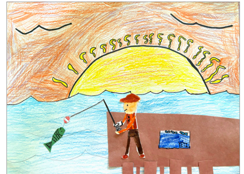
Colored pencil, markers, Sharpie, and construction paper