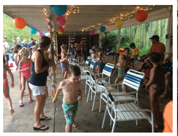
Musical chairs is always a favorite.

The 2016 Wiltondale Annual Party at the pool was once again a success. Thank you to everyone who helped out to make this a great party!